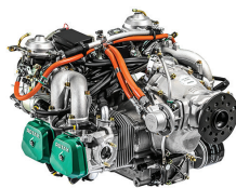
ROTAX 912 ULS (100 HP)