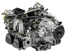
ROTAX 912 UL (80 HP)

4 stroke "Rotax" range of aircraft engines, all with simple maintenance schedules. Rotax engines have a 2000 hour TBO, with the ability to "run on condition" thereafter, with many examples lasting over 4000 hours.