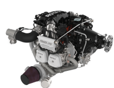
ROTAX 916 IS (160 HP)