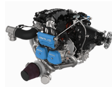
ROTAX 915 IS (141 HP)