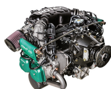
ROTAX 912 IS (100HP)